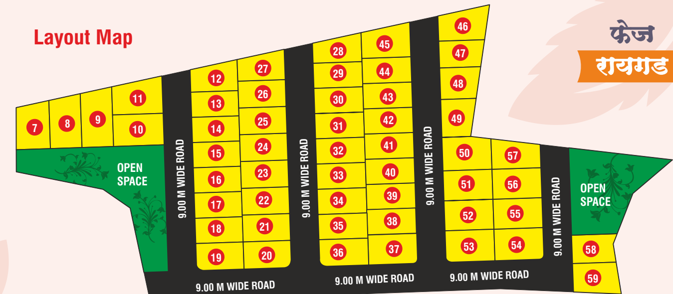
SCHEDULE OF PLOT : Raigad - Phase I